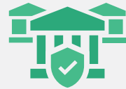
FDIC-insured Program Banks

We deposit your cash into one or more of the banks we partner with